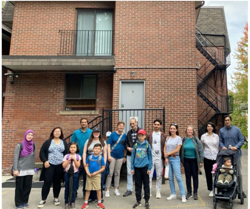
Our HOTT staff and volunteers on our annual fundraising walk back in October!

Wishing you a year of happiness, health, and prosperity. Thank you for being part of our journey. Let's make this year extraordinary!